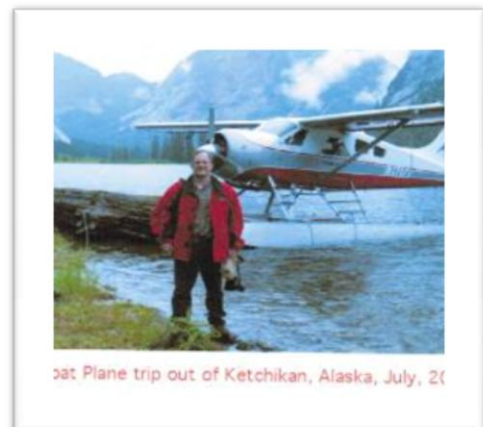
Float Plane trip out of Ketchikan, Alaska, July, 2005